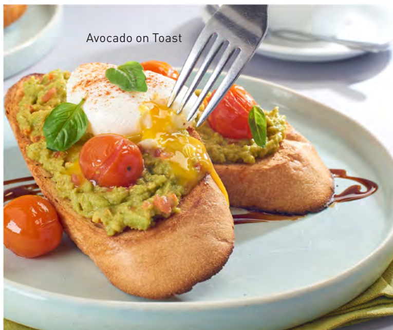
Avocado on Toast