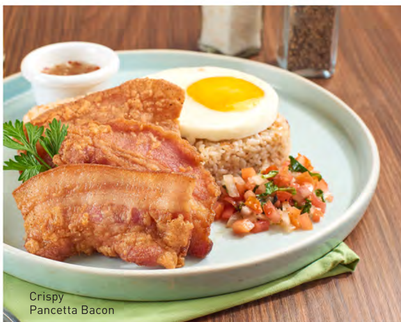
Crispy Pancetta Bacon

Thinly sliced, tender sirloin beef, marinated in a sweet and savory blend, served with garlic rice and egg 495