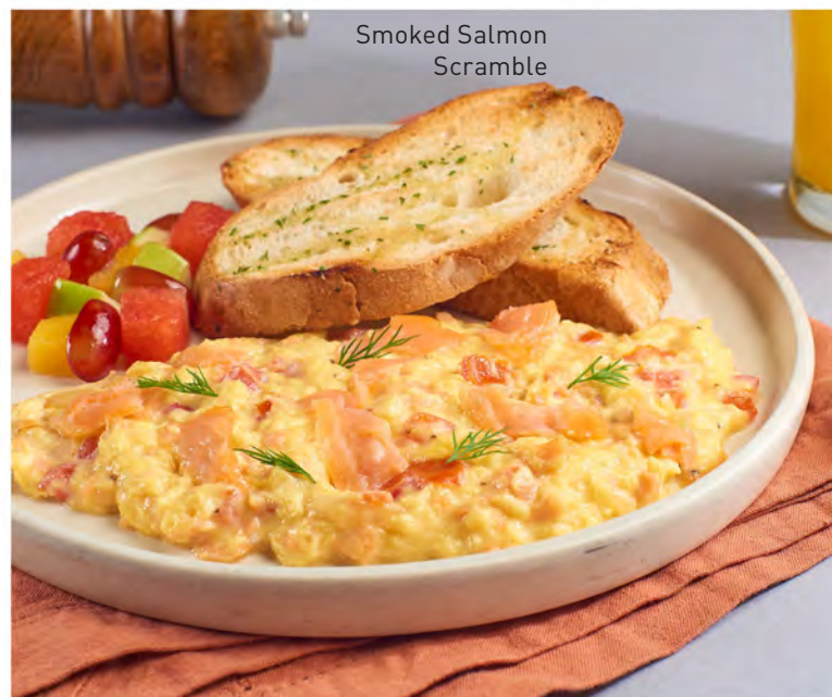
Smoked Salmon Scramble