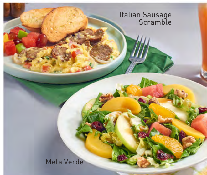
Italian Sausage Scramble

Smoked salmon, scrambled egg, tuscan toast 475