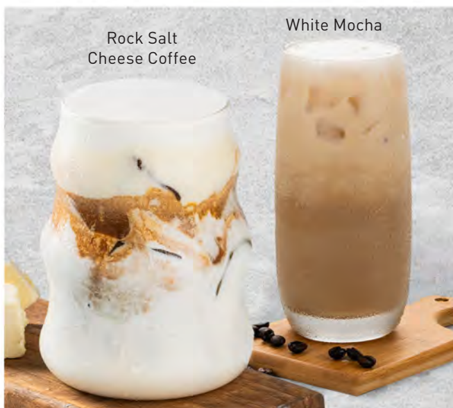
Rock Salt Cheese Coffee