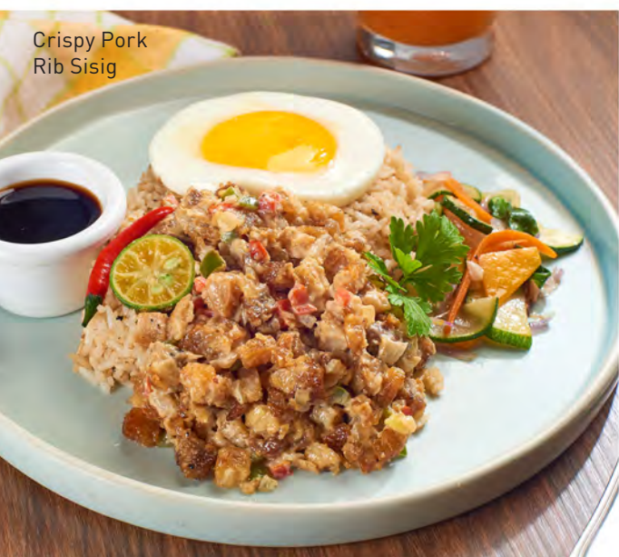
Crispy Pork Rib Sisig