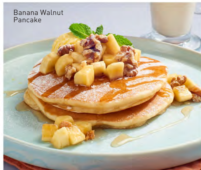
Banana Walnut Pancake