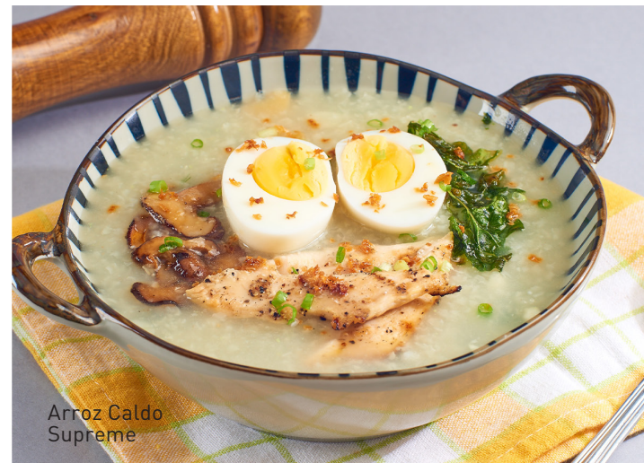
Arroz Caldo Supreme