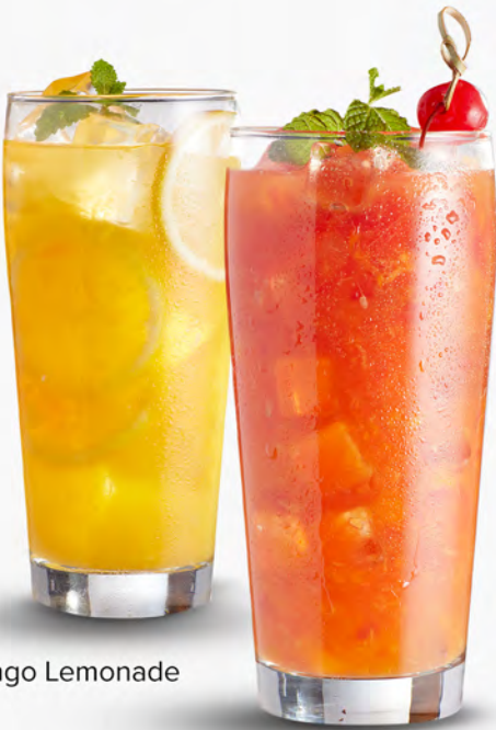
Peach Mango Lemonade