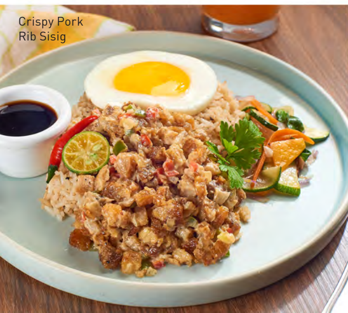
Crispy Pork Rib Sisig